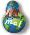
Mojraze Corporation limited