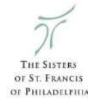
Sisters of St. Francis of Philadelphia