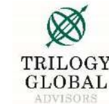
Trilogy Global Advisors, LP