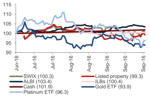
Chart 1: SA asset class returns in 3Q16 (indexed)

Recent underperformance from listed property has meaningfully improved its future return prospects, in Momentum Investments opinion, particularly against the backdrop of an improved local bond market outlook. Although risk-adjusted local cash returns currently still look decent in a low-return environment, re-investment risk should increase going forward, as the local rate cycle peaks.